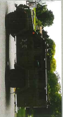
Waukesha County Bearcat