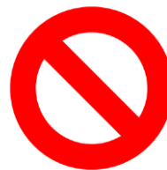
Example of an improperly packed bin

Thank you for your partnership! Following these simple guidelines has already proven successful and is allowing us to divert several million pounds of plastic every month from going to landfills; it also allows us the opportunity to save you time and money. This program has also allowed us to create many jobs in the Midwest Region and many local businesses are seeing increased revenue in our service areas. This is a great program with huge benefits for everyone and we are excited to share this program with you.