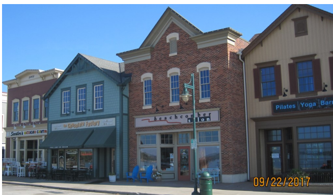
Externally-lit uniform wall signs (Pewaukee)