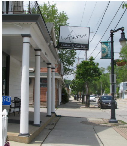
Projecting sign, oriented to pedestrian and driver (16 sq. ft.)