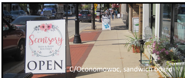
C/Oconomowoc, sandwich board

Generally, sandwich board and window signs do not require permits, but there are regulations to follow.