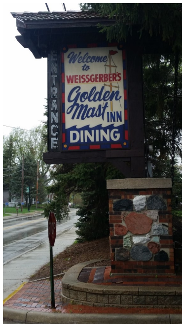
Free standing sign with monument base