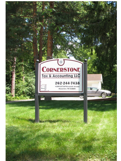
Free-standing post sign (15 sq. ft.) 20 ft. setback from ROW