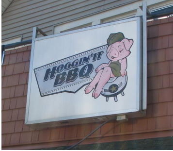
Internally-lit sign (20 sq. ft.)