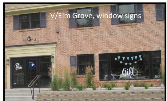
V/Elm Grove, window signs