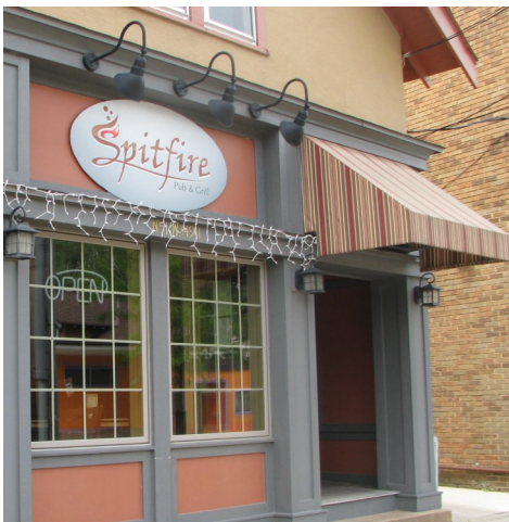
Externally-lit wall sign (12 sq. ft. )