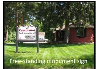
Free-standing monument sign

Municipalities frequently determine maximum size of a wall-mounted sign through a ratio or percentage of a building's width.