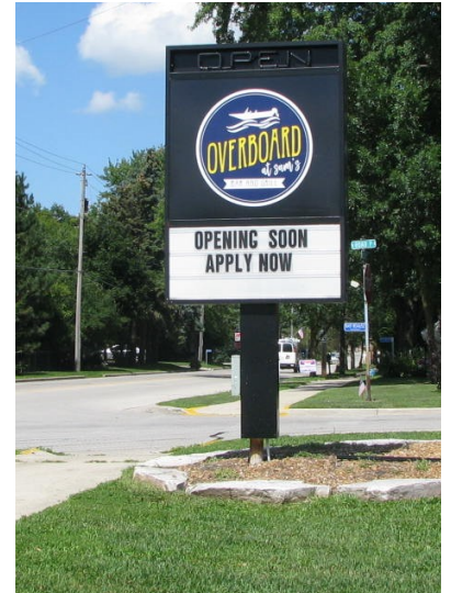
Free-standing pole sign with marquee (approved via variance). 11'9" tall, 36 sq. ft., double sided & illuminated. Located outside of ROW