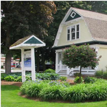
Free standing post sign face (20 sq. ft. sign face), externally lit. Overall 10'6" H x 9' W x 5 D