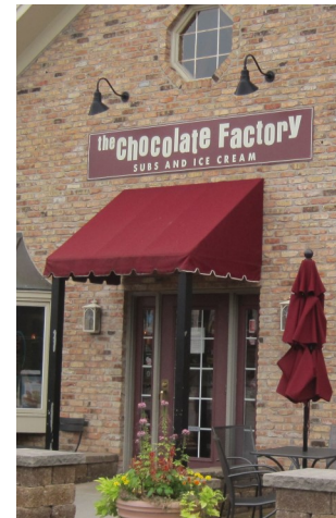
Externally-lit wall sign (Elm Grove)