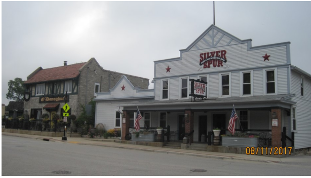
Wall signs and projecting signs, 0' setback (Elm Grove)