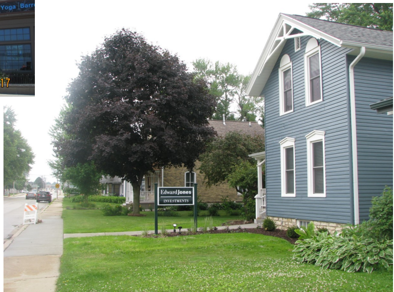
Free-standing post sign in transitional area on Oakton Rd, Pewaukee