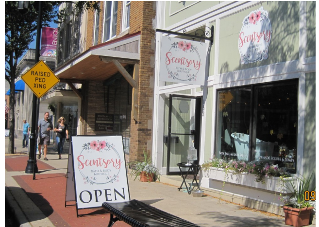
Wall sign, projecting sign, sandwich board and window advertising (C/Oconomowoc)