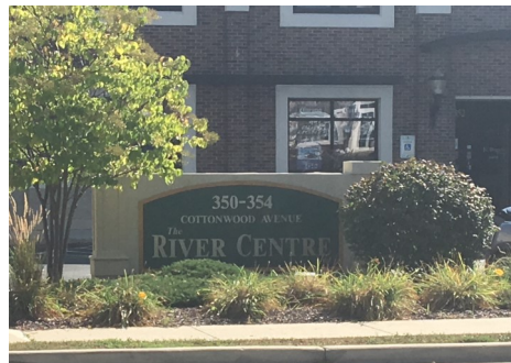
Monument sign with landscaping (Hartland)