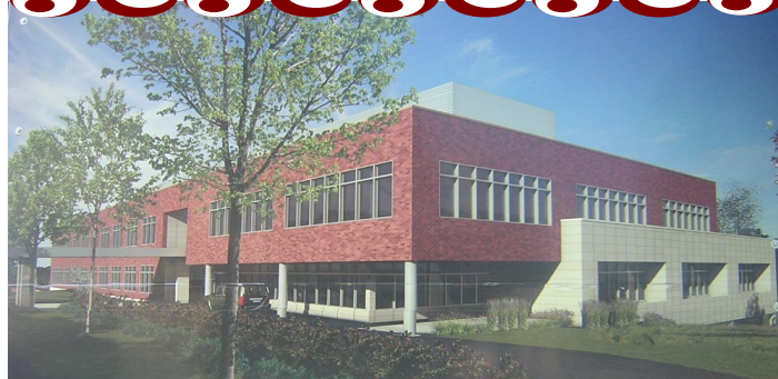
Leading the way to a healthier Waukesha County