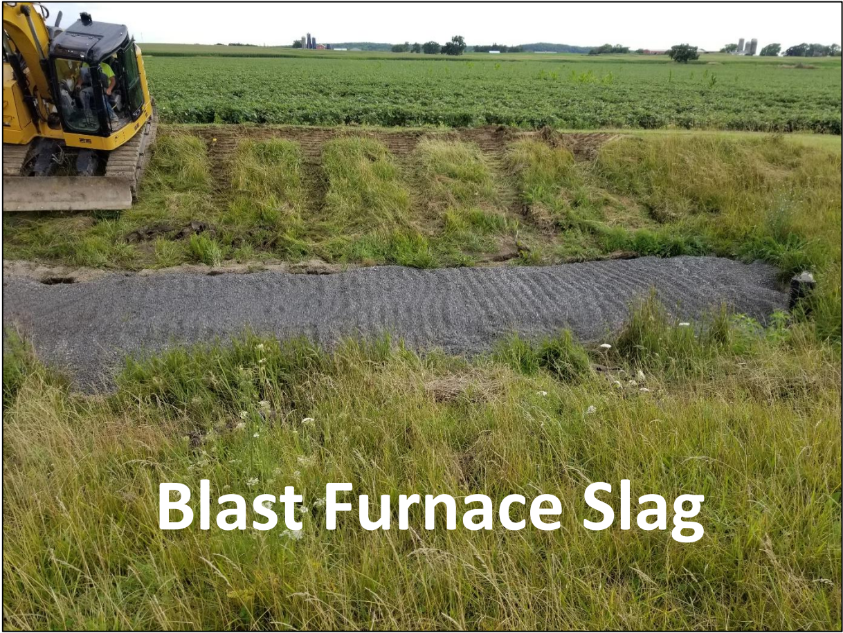
Blast Furnace Slag