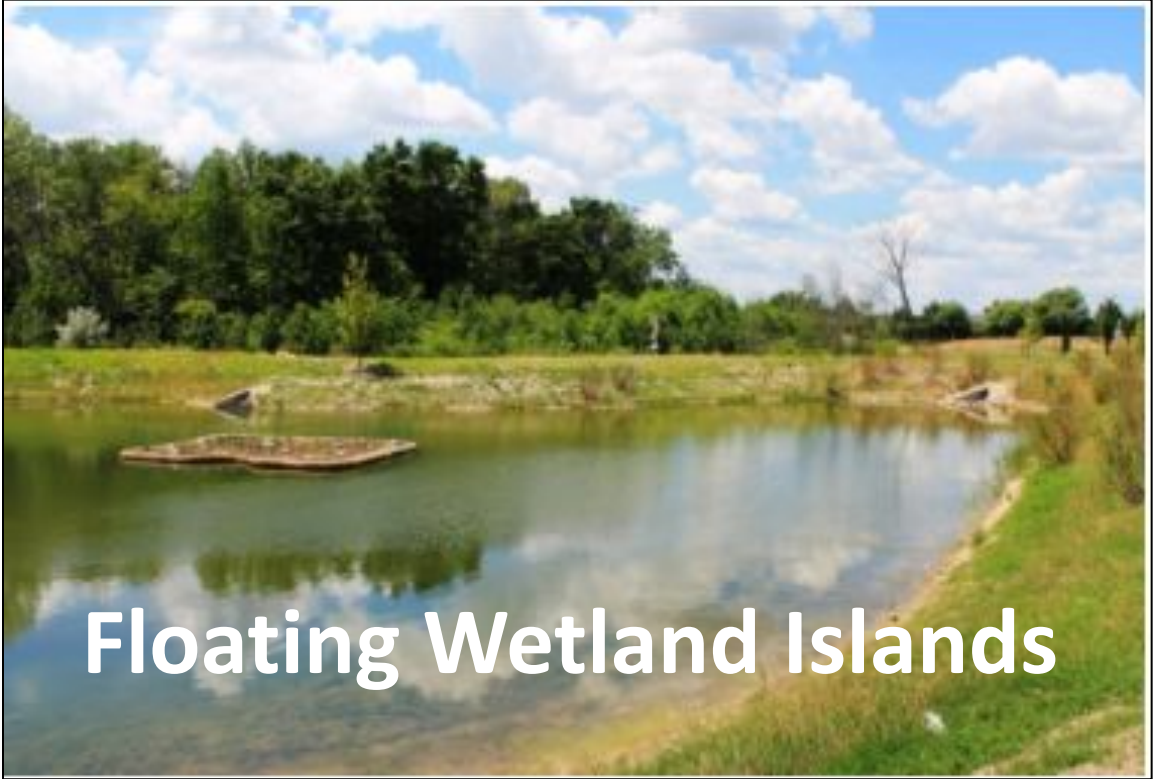
Floating Wetland Islands