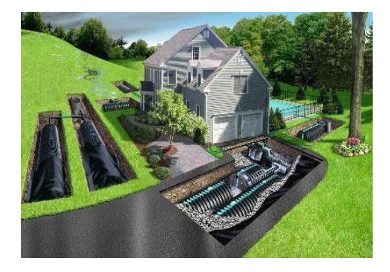
Infiltration chamber