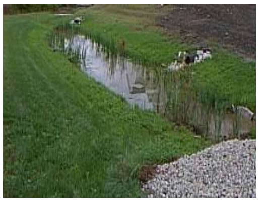
Grass swale