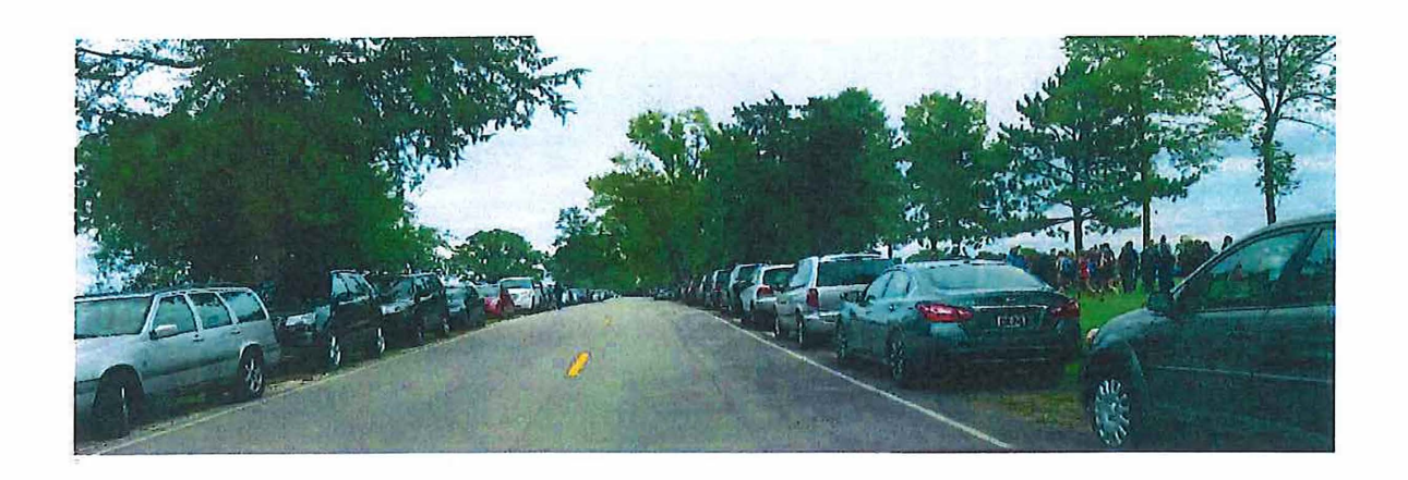
Looking east along CTH K towards CTH E.