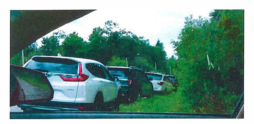
Looking west along CTH K from Monclaire Rd