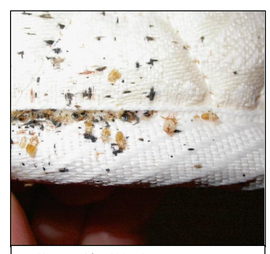
Bed bugs and fecal blood stains on a mattress.

Heat treatment—heating a room and its contents to above 120 degrees Fahrenheit. This is done through the use of a specially designed and approved heating device.