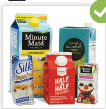
Food and Beverage Cartons