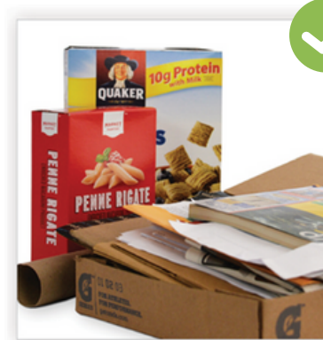
Cereal Boxes, Mail, Magazines, Newspaper, Flattened Cardboard, and Paper Tubes