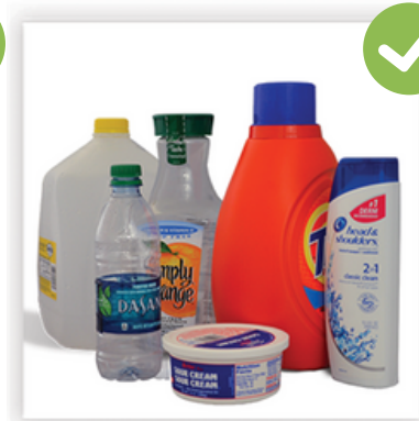
Kitchen, Laundry, Bath: Bottles and Containers ♻️ #1, #2, #4, #5