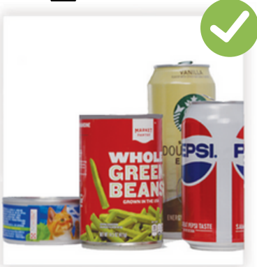
Food and Beverage Cans