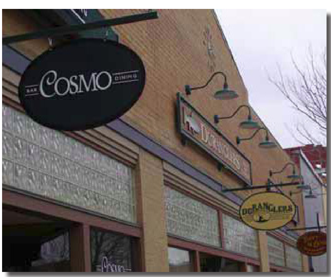
Mt. Pleasant, MI Downtown Signage Design Guidelines