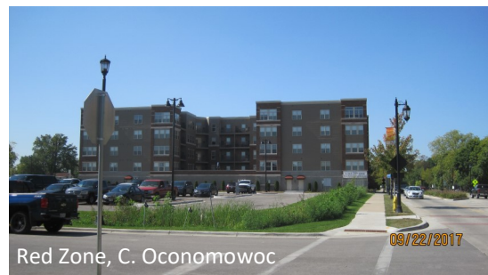
Red Zone, C. Oconomowoc