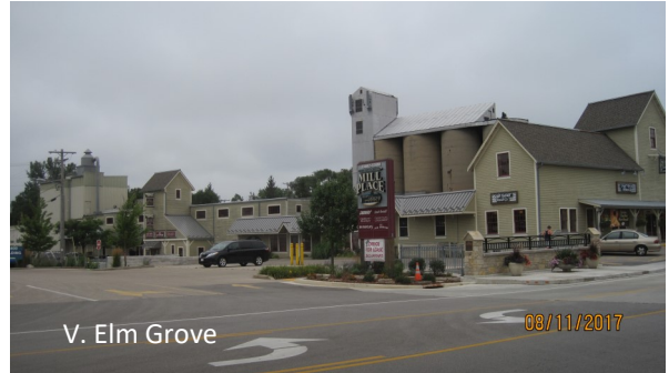
V. Elm Grove