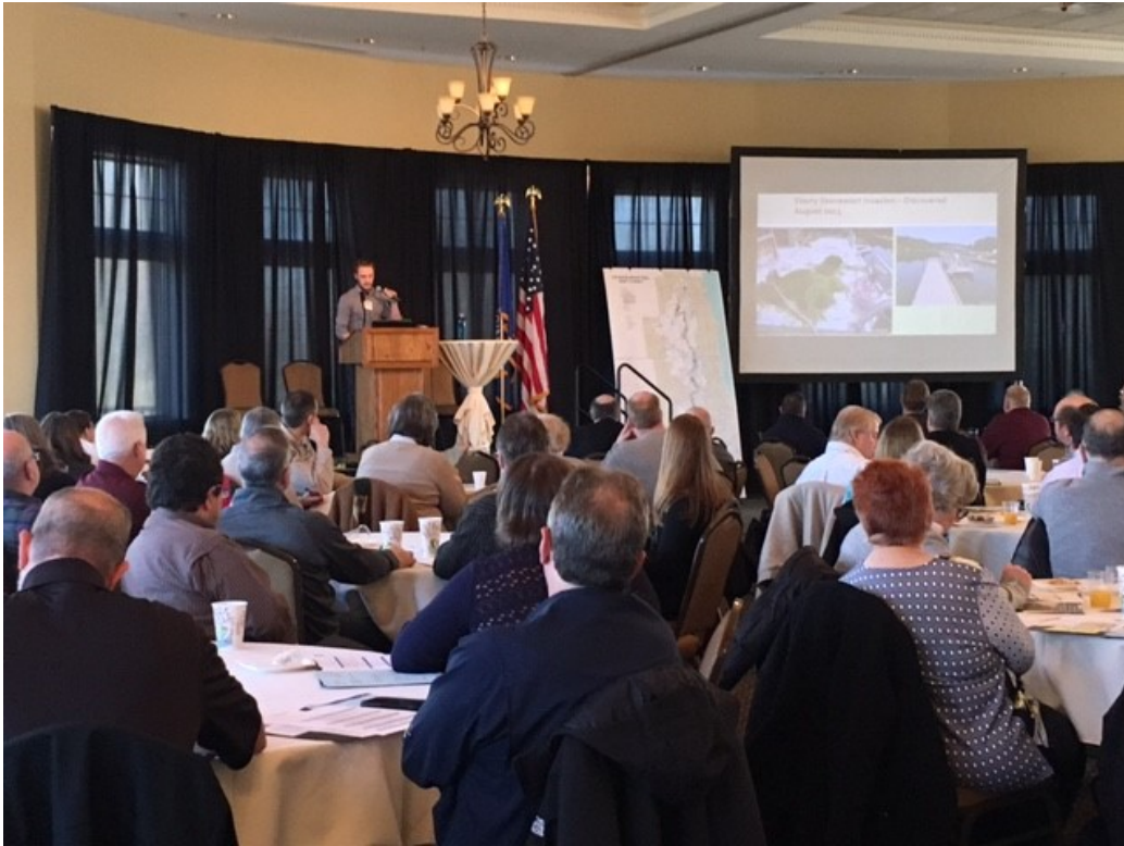
AIS Coordinator speaks on starry stonewort life history, and treatment options.

AIS Partnership: The Quarterly AIS Partnership Meeting took place on March 14th and 15th at the University of Wisconsin, Green Bay. The AIS Coordinator was in attendance and had the chance to take note of some major updates to the AIS Program this field season. There will be updates in a few areas including Citizen Lakes Monitoring Network, Clean Boats Clean Waters, and the AIS Snapshot Day, which is taking place on August 5th, 2017.