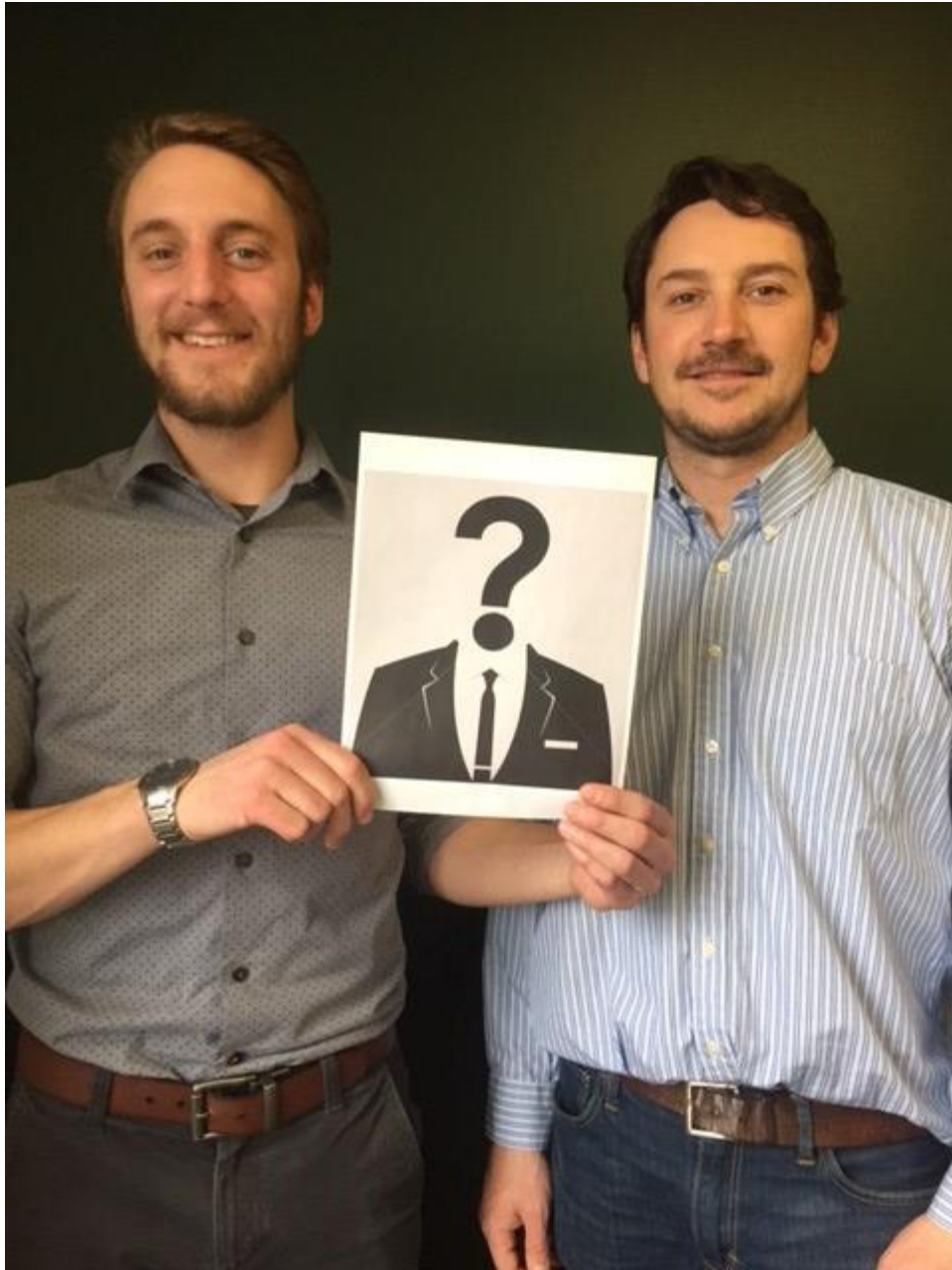
Searching for the summer AIS Intern.

To subscribe to this Waukesha County Aquatic Invasive Species Update Newsletter by clicking the image below or here!