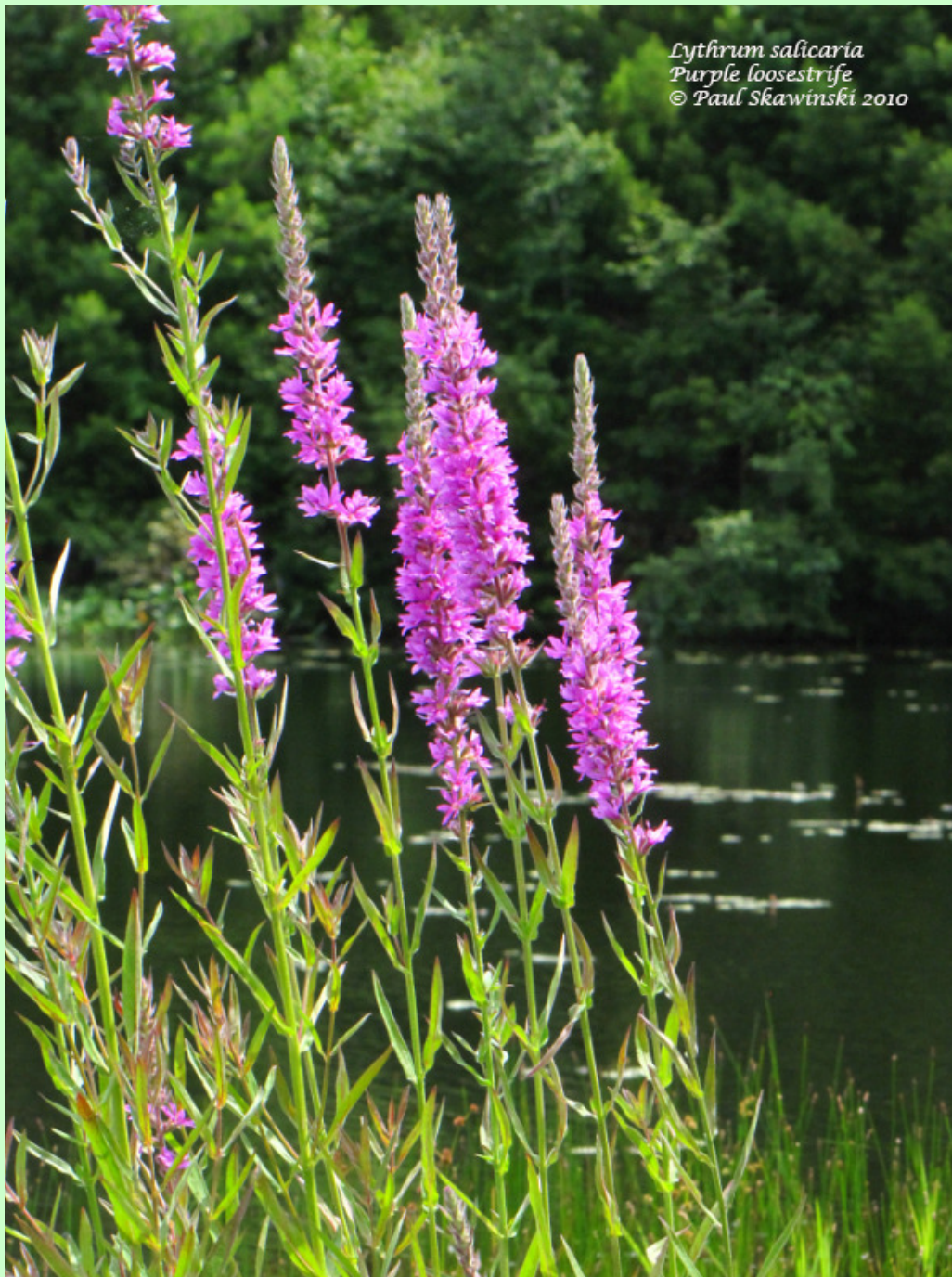
Lythrum salicaria Purple loosestrife