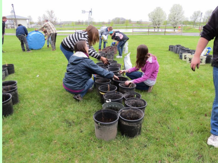
4H Volunteers plant purple loosestrife into pots and get ready to take them home to grow and eventually add beetles.