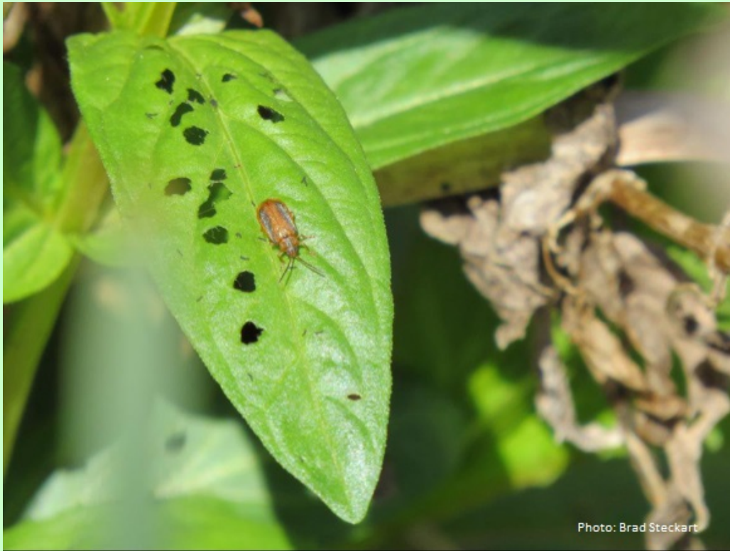
Galerucella beetles love to munch on the leaves, flowers, and stems of purple loosestrife.

Interested in joining and growing some Purple Loosestrife Beetles? Community members are welcome to join a group from Carroll University in this effort to help dig up roots and plant purple loosestrife into pots on Sunday, April 23rd. The sites and times are to be determined, but if you're interested, you can Sign Up for Purple Loosestrife Rootstock Collection and Planting Day HERE!