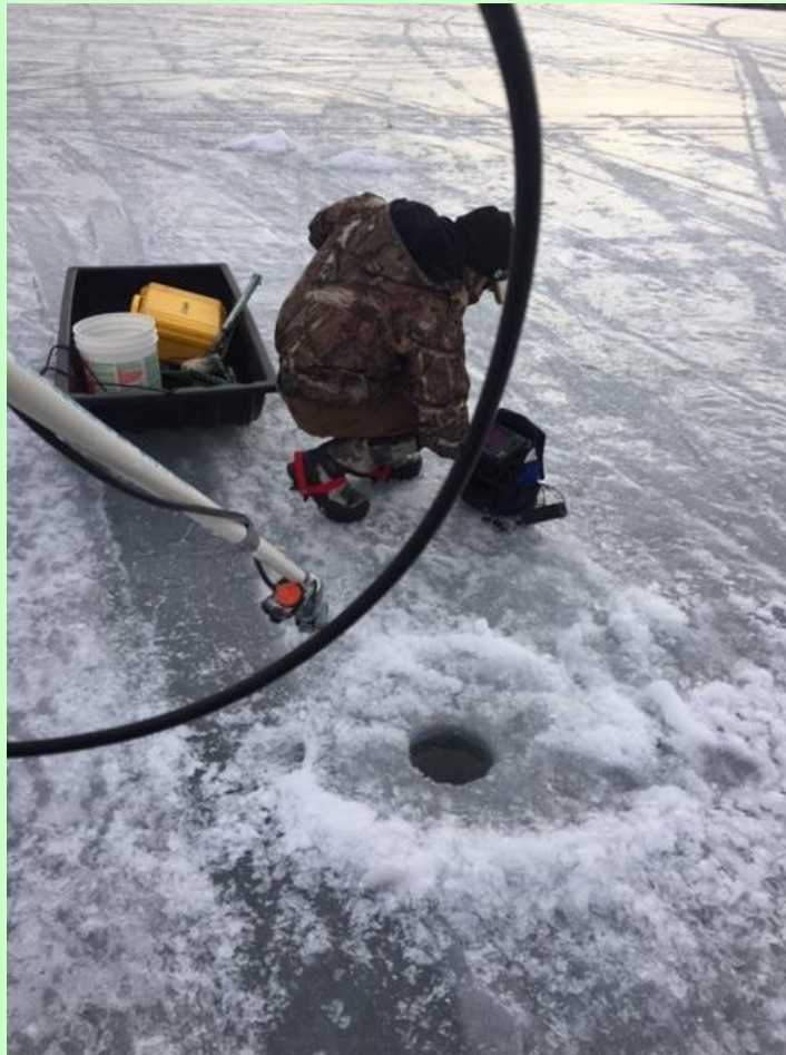
The AIS Coordinator uses an underwater camera to look for aquatic invasive species under the ice.