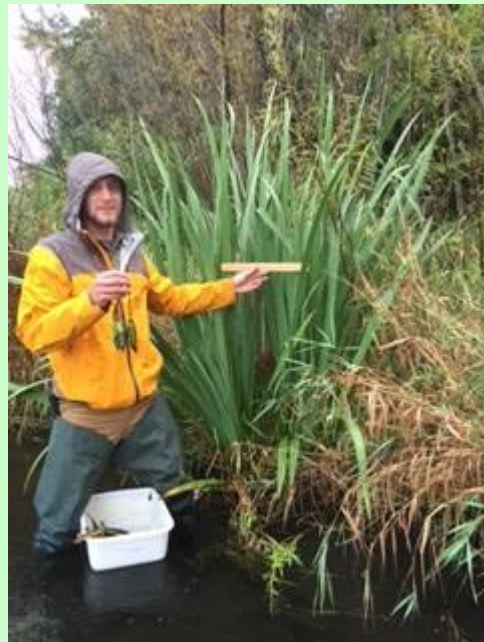
Coordinator measures an invasive yellow iris.

To subscribe to this Waukesha County Aquatic Invasive Species Update Newsletter by clicking the image below or here !