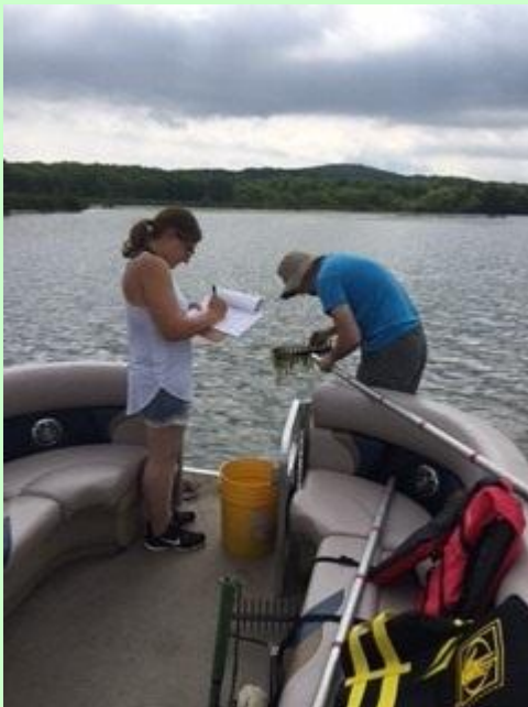
(Left) - Aquatic Invasive Species Interns from 2016 conduct a point-intercept survey. (Right) - AIS

Training and work direction will be provided by the AIS Coordinator. Click this link or the pictures below for full job description and to apply!!