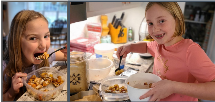
Kids in the Kitchen, a program teaching 3rd—6th graders about cooking and creating healthy habits, was held virtually three times in 2020 with different target audiences; 4-H youth, Waukesha County youth, and homeschoolers.

"I appreciate you keeping these (Waukesha County Nutrition Coalition) meetings going during these challenging times as the updates are more necessary than ever. So thank you so very much for all your time on this!" WC Nutrition Coalition Member