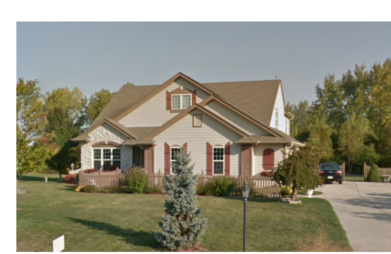
24'(35' Exposed) 30' (38' Exposed)