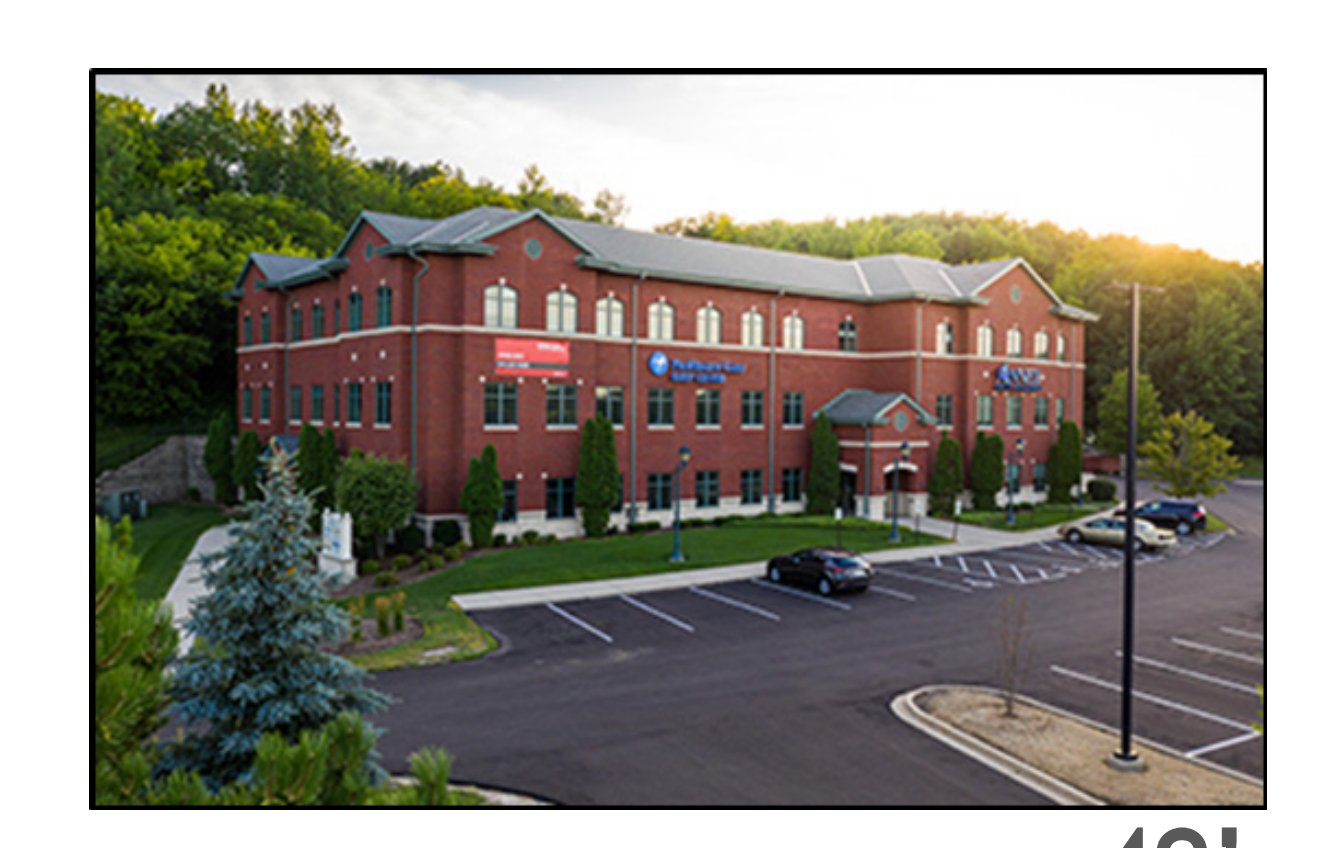
35' Roadside (16' Typ Roof Line)